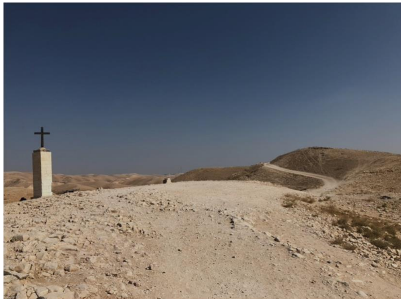
A road through the desert from Jerusalem to Jericho

Jesus's own journey recounted in the second half of Luke's Gospel, has been described by many commentators as 'The Road to Jerusalem'. It starts with Jesus setting his face in the direction of the Holy City and then in the ensuing ten chapters (Luke 9-19), Jesus makes a geographically circuitous, but a theological straight line, to his confrontation with the powers and authorities of his time.