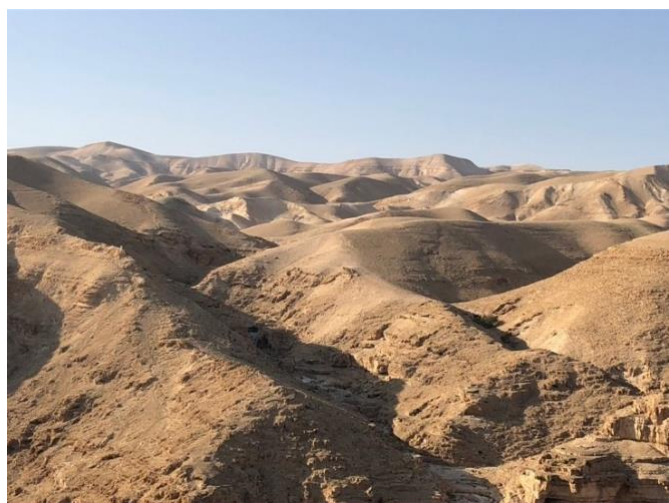
The Judean desert

The road and the concept of a journey is a theme which reaches back into the Old Testament; it provides a template for Jesus in his ministry and also perhaps for us as Christian pilgrims. Abraham sets out from Ur and then Haran to find the land promised to him by God (Genesis 11-13). Moses led the people out of slavery in Egypt, through the desert and eventually into the Promised Land led by Joshua (Joshua 1-3). The theme continues and perhaps most significantly, God opens up a road for the Jews to return from exile in