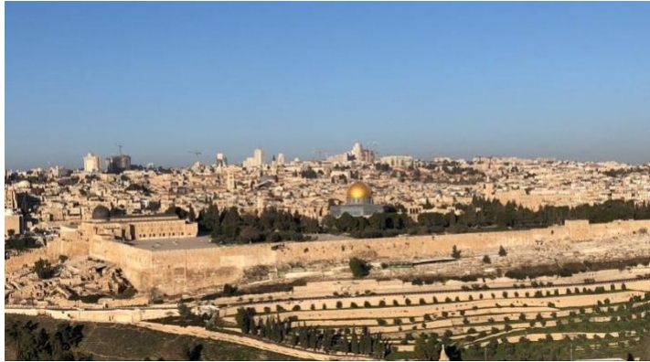
Overview of the Old City of Jerusalem