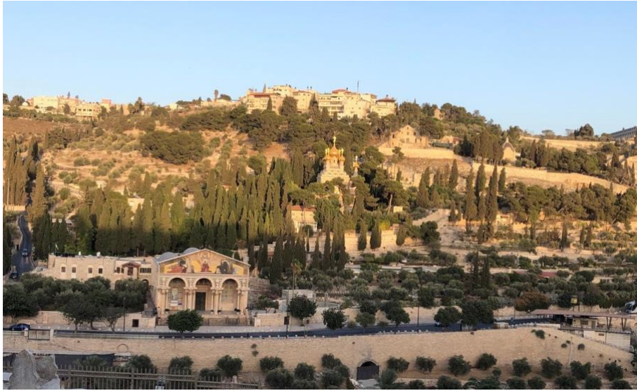
The Mount of Olives – Dominus Flevit Church can be seen top right

is feted by the crowds as his journey to Jerusalem seemingly comes to a triumphal climax as he walks from Bethphage.