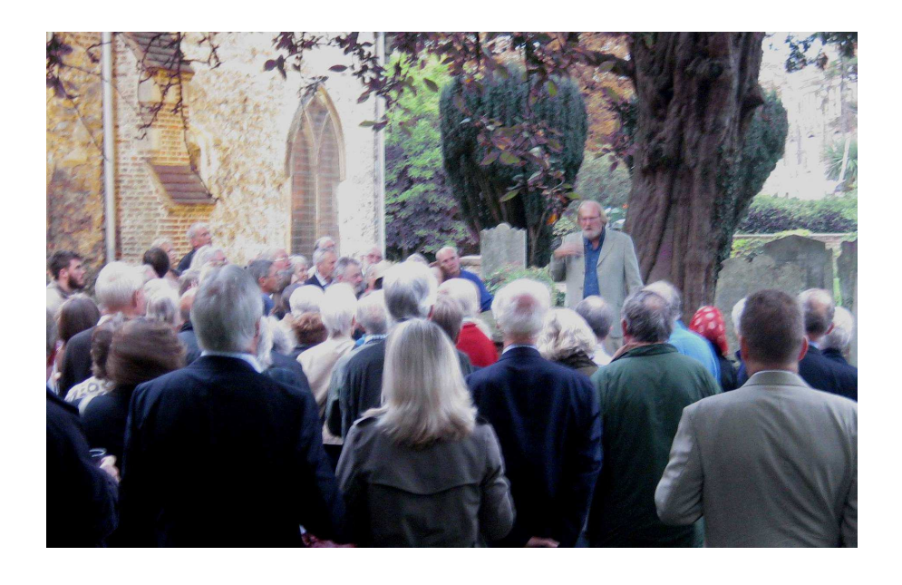
ANNUAL REPORT 2011

The Friends of St Mary's Barnes raise funds for the upkeep of the church building and churchyard and promote public awareness of the church's place in the history and life of Barnes. They also ensure that it is open to the public every day. Our programme of events raises funds for the continuous care of the church and for capital projects. The last year has again been financially successful raising £50,000 for the Friends fund as well as considerable sums for other charities, due largely to the great success of the Barnes Charity Ball, St Mary's Archaeology and the Barnes Charity Fashion Show.