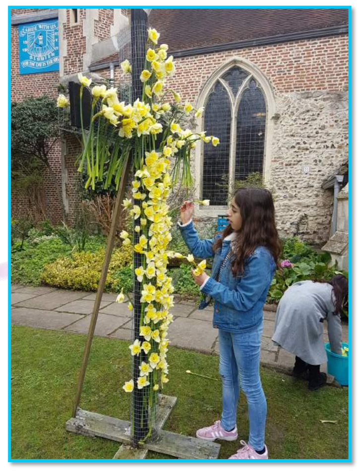
The Easter Cross