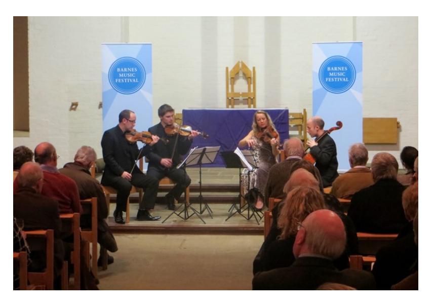
Villiers String Quartet playing at the Barnes Music Festival 2013