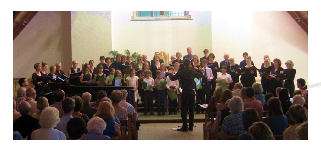
Scholars Concert with the St Mary's Music Scholars and Senior and Junior Choirs in June 2013