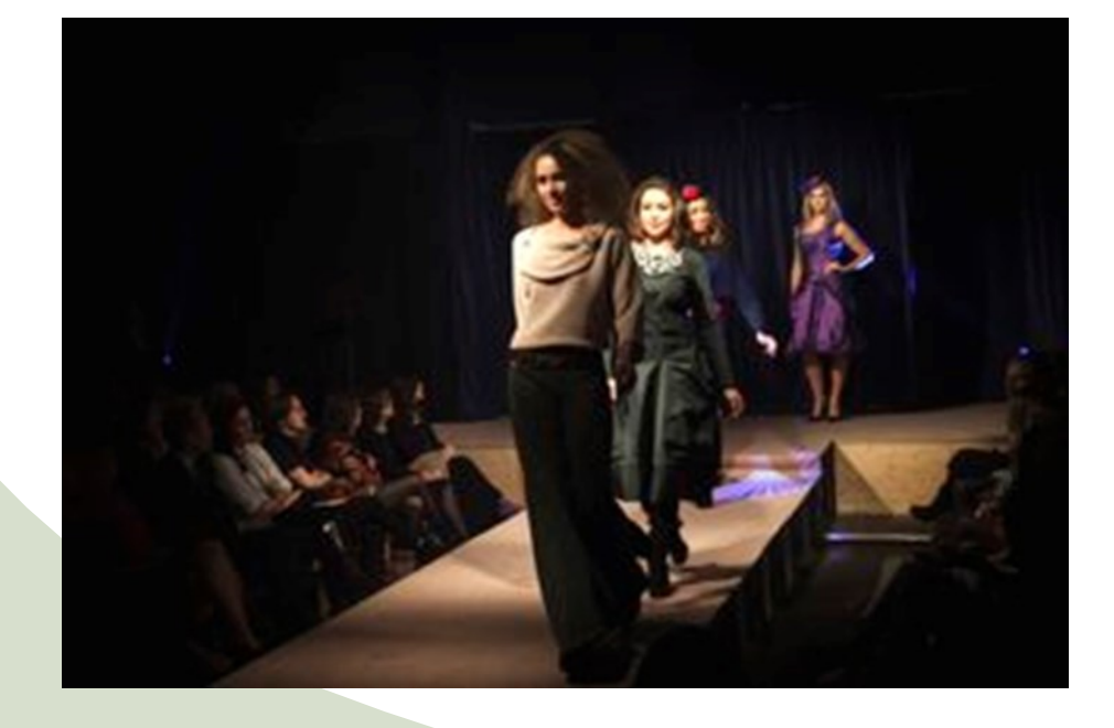
Models show off latest fashions at the Barnes Charity Fashion Show in October 2013