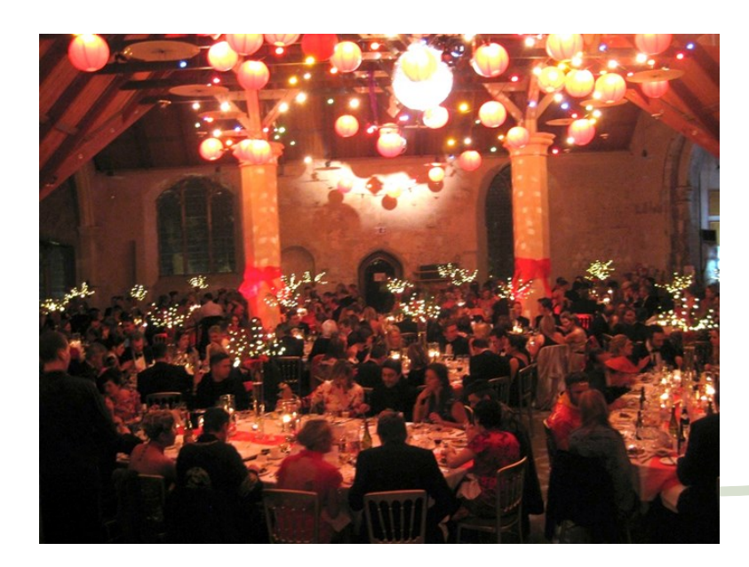
Guests enjoying the Barnes Charity Ball Tales of the Orient at St Mary's in February 2013