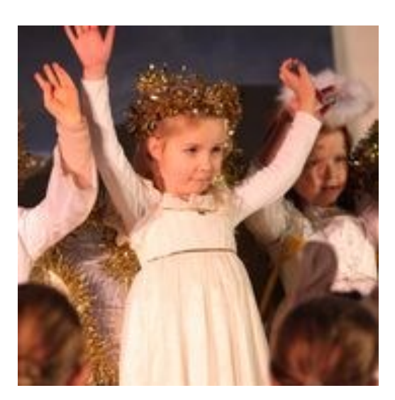
The Nativity at St Mary Barnes 2013